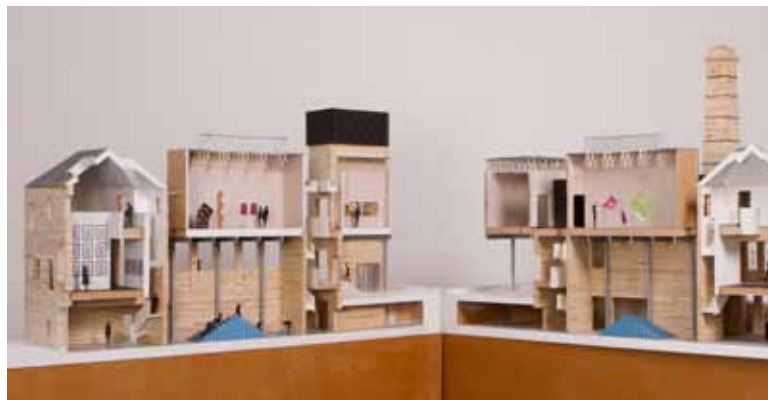
© Assemble: Model of Goldsmiths CCA