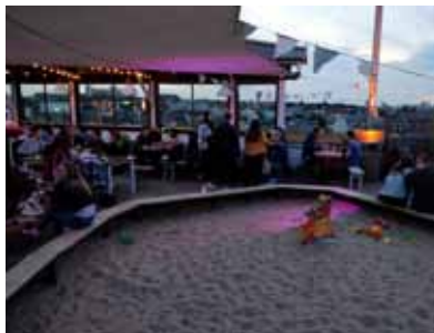
Holzmarkt, Berlin(top) Klunkerkranch, Berlin (bottom)